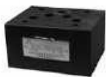
Z 1S 10 -A -2 -30Y/ V *