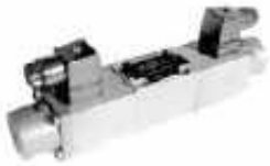
4WRA 6/10 -E- 3 -10Y/ *