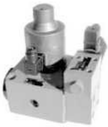
EFB G -03 -125 -C -15