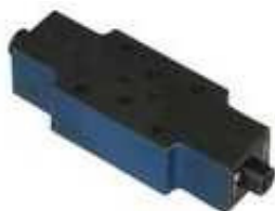
Z 2FS 6 -2 -30Y/ * -V -*