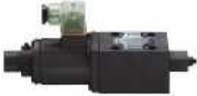
EDG -01 V -C -1 -PN T13 50Y

Proportional Relief (Pilot) Valve——EDG-01*-* -P-PNT*-50Y