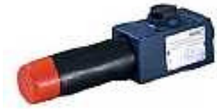
Z DR 10 -DP -2 -40Y/ 210 Y M