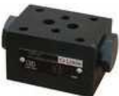
Z 2S 10 -A -2 -30Y/ V *