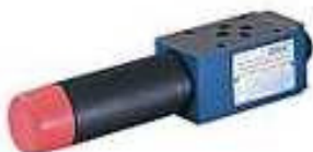
Z DR 6 -DP -2 -30Y/ 210 Y M