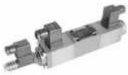
4WRE 6/10 –E- 3-10Y/ *